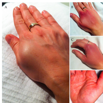
Figure 1 Haematoma in first webspace approximately 8 hours post-needling (A); bruising apparent 4 days later (B, C); haematoma visible in palm 10 days later (D).

Arterial injury from needling LI4 has been reported, 3 and in the same paper the distance to the nearest artery at LI4 was measured to be <10 mm in one fifth of a cohort of 20 subjects as part of a prospective MRI study. What is most interesting in the report by Wong and Hobara is the position of the thumb and first web space, which are perpendicular to the plane of the palm of the hand during imaging. The anatomical significance of this will be discussed and illustrated below.