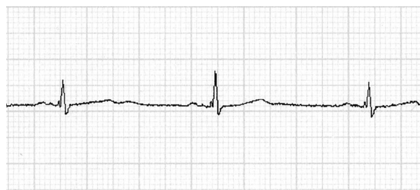
Figure 2 ECG after conversion: sinus rhythm of 52 beats/min.

In 2012 the recurrence of AF was resistant to the therapeutic measures that had proved effective since 2006. Given his comorbid condition, our intention was to avoid amiodarone and instead opt for catheter ablation, which had developed into a common and effective treatment in recent years. The restoration of the shape of the LV upon conversion to SR was an important argument by the electrophysiological team of clinic D to accept this patient for the ablation procedure. In the preparation of the catheter ablation an MRI showed a thoracoabdominal aneurysm. Although correction of the aneurysm and ablation was planned in one procedure in clinic E, the surgical intervention was restricted to the aneurysm because it proved to be too extensive. The postoperative course was delayed due to difficulties in weaning the patient off artificial ventilation given the existing pulmonary weakness. Incidentally, the surgeon in charge of the procedure reported that pulmonary function was abnormal upon thoracotomy: the lungs showed no collapse under pressure changes to the chest cavity but required manual assistance to be held aside as 'big rigid sacs'.