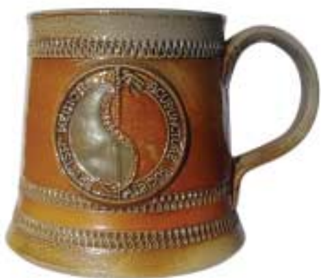
Figure 1 Pottery mug specially commissioned, showing BMAS logo.