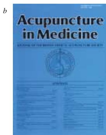
Figure 2 Covers of earlier editions of Acupuncture in Medicine a) 1983 -1987 b) 1988-1998.